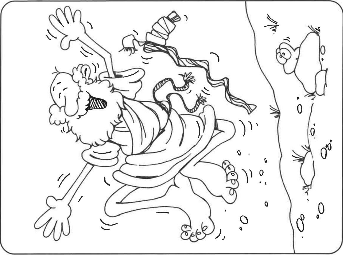
The blind receive their sight and the lame walk, lepers are cleansed and the deaf hear, and the dead are raised up, and the poor have good news preached to them. Matthew 11:5

Permission to copy granted for one-time use on December 11, 2022, only.