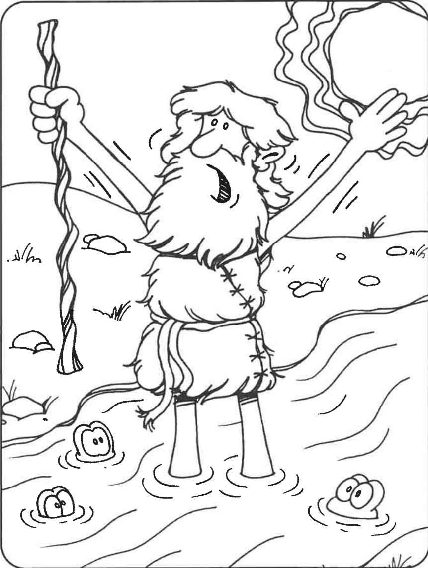
In those days John the Baptist came preaching... "Repent, for the kingdom of heaven is at hand." Matthew 3:1-2