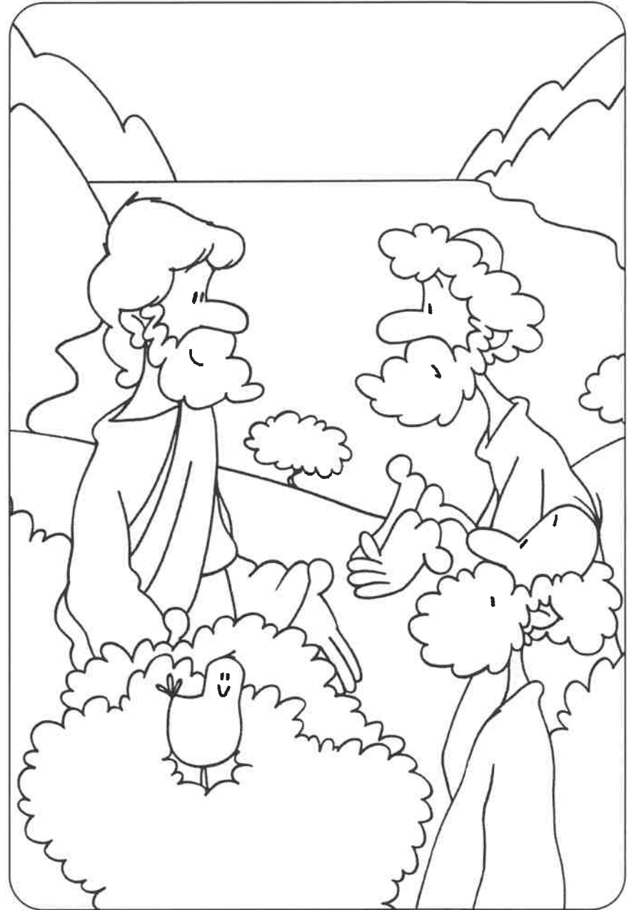
The apostles said to the Lord, "Increase our faith!" Luke 17:5